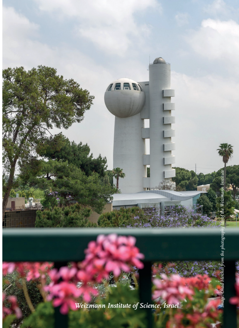
Weizmann Institute of Science, Israel

Our Foundation's geographic focus is on Switzerland (with an emphasis on the Zurich region) and on Israel. We assist both Jewish and non-Jewish causes and institutions.